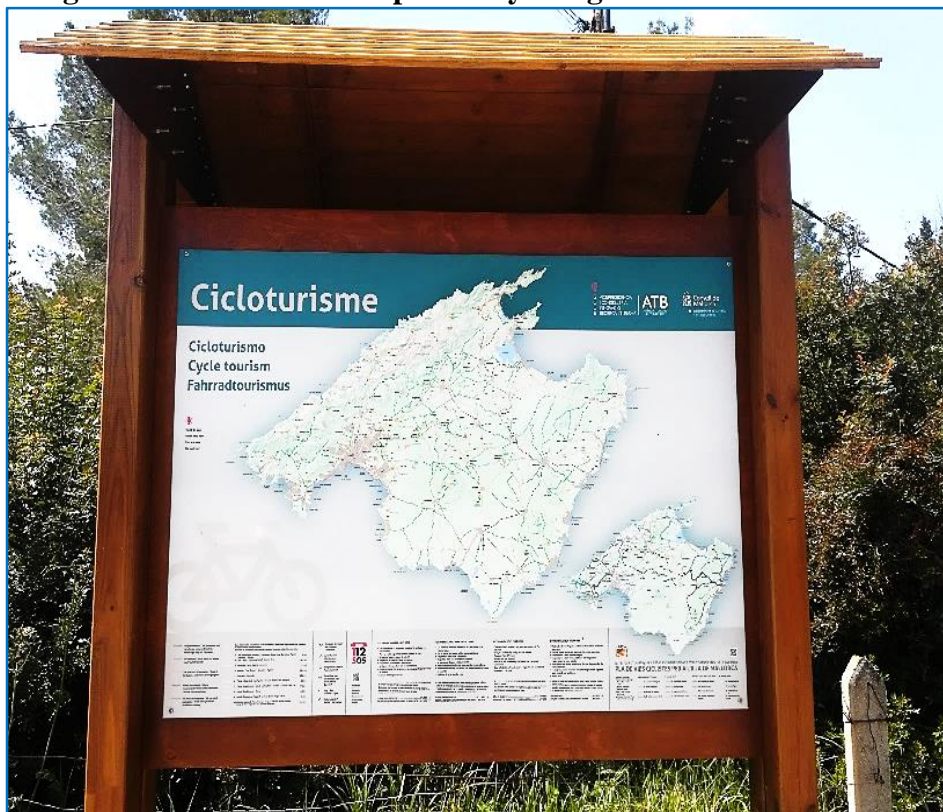
Figure 3. Information panel cycling routes in Mallorca.

Within the cycling tourism market, the demand for bikepacking, e-bikes and mountain bikes are growing, but Mallorca has hardly any infrastructures and services to meet the needs of this type of client (ICG).